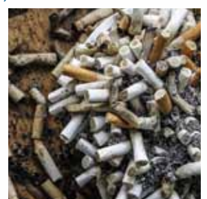
Intshontsho lengabangaba litya isitompisi zesigarethi licinga ukuba kukutya

Kwaye, nceda uqonde ukuba isigarethi esivuthayo esilahlwa ngefestile kwimoto ehambayo singadala imililo yamadobob namadlelo kwaye isigarethi esivuthayo esilahlweyo naso saziwa ngokutshisa amakhaya atshe ngqongqo.